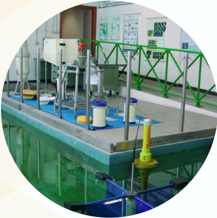
OGS LABORATORY: TESTING TANK, A SHIP MODEL BASIN

In addition to lectures and tutorials, the training programme includes special events, site visits, hackathons tutorials and networking activities to enrich the learning experience.